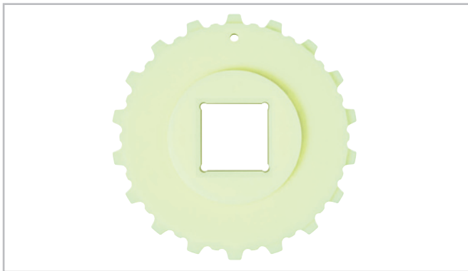
Sprocket one-piece (solid)